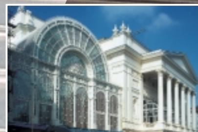
Royal Opera House, London.