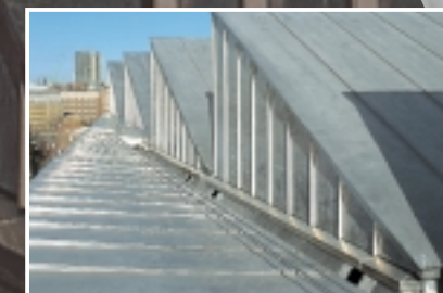
Royal Opera House, London.