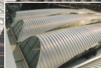
Leisure centre, London.