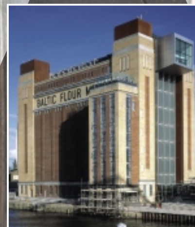
Baltic centre, Gateshead.