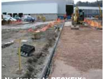
No damage to RECYFIX® HICAP® channels during installation