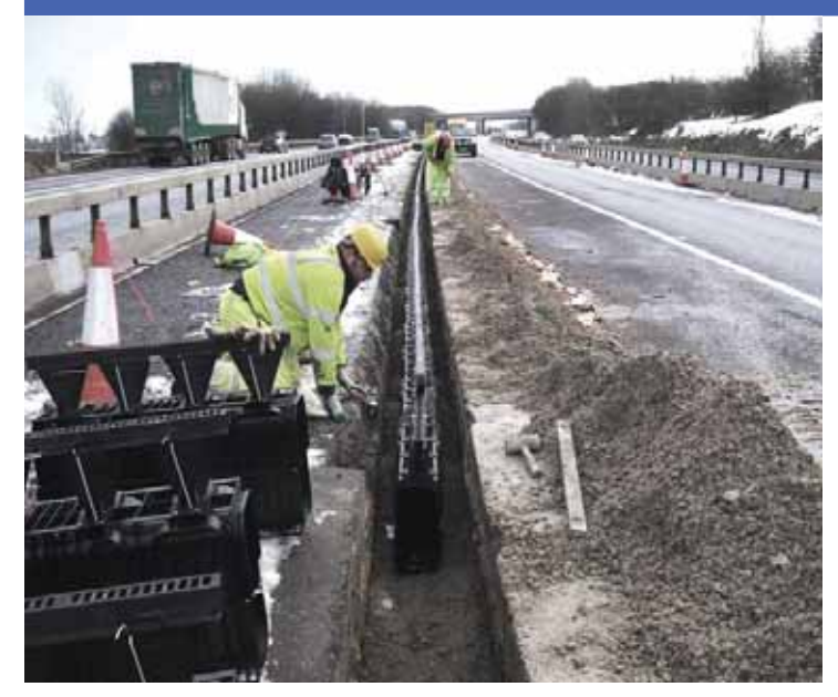
One man lift enables easy positioning of the RECYFIX®HICAP®