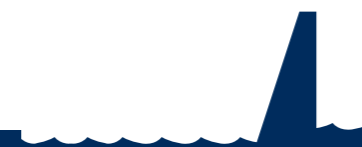
RESERVOIRS AND DAMS