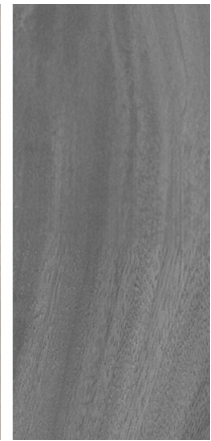
Ageing scale depending on maintenance & exposure