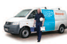
Lift Service and Repair