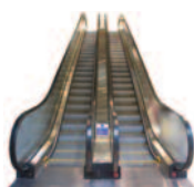
Escalators and Moving Walkways