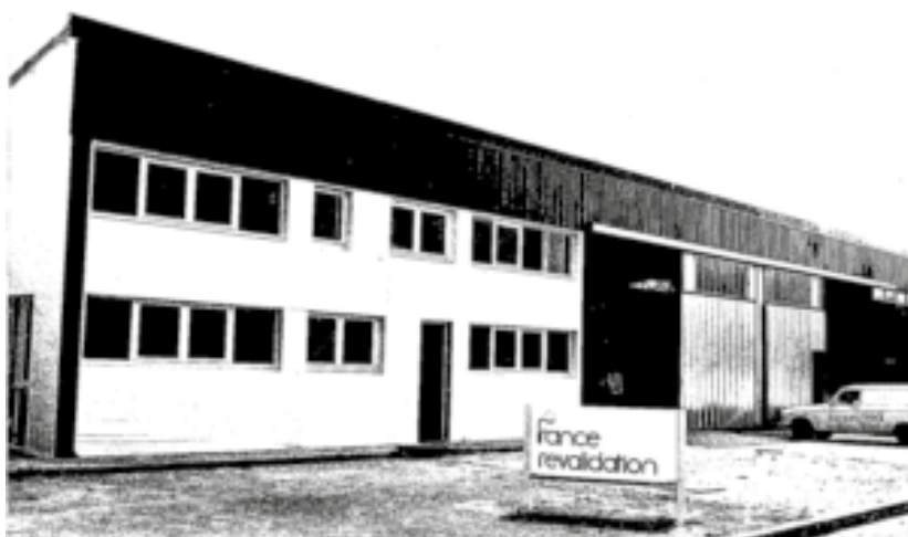
Creation of Reval - 1976

Being experts in our field we have been able to gain the trust of industry professionals through the execution of well thought out quality design, clever technological advancements and continuous product innovation that address real industry challenges.