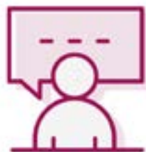
Free One to One Consultation