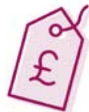
Payment Guidance and Support