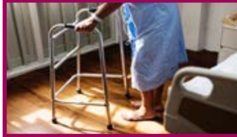
Long Term Care