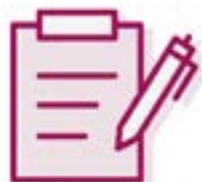
Quotations and Best Advice