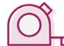
Survey Assessment advice