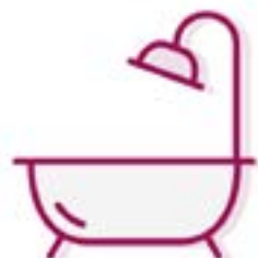
Installation & Commission Facility and Support