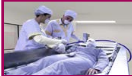
Acute Burns Therapy