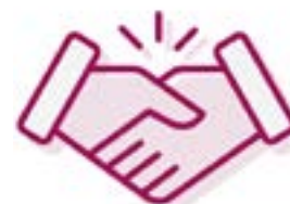
Product Lifetime Support