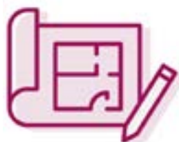
Planning & Design Consultation