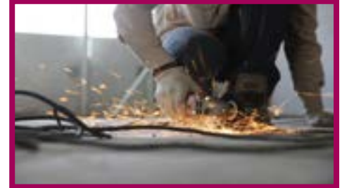
Construction and Design