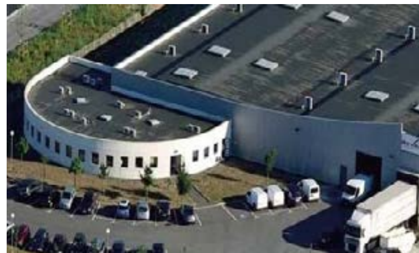
Reval Head Office in La Rochelle - 2019