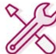
Service and Repair Support