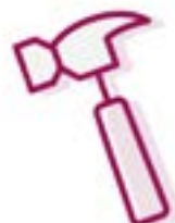
Products Built to Suit Needs