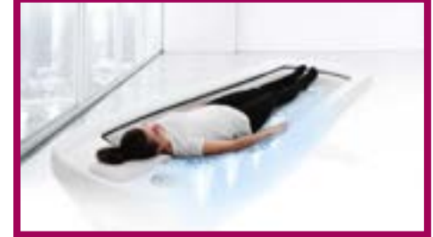
Spa and Relaxation