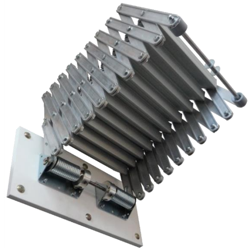
Spring-assisted operation of the retractable ladder (Piccolo Premium)