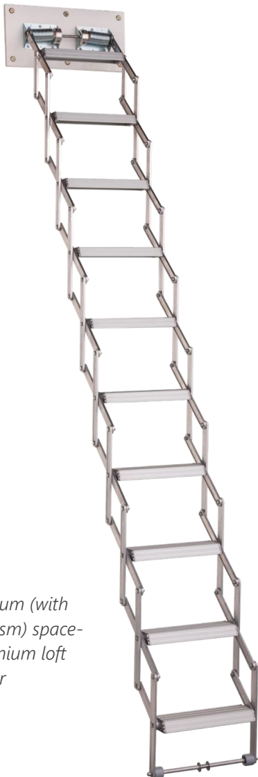
Piccolo Premium (with spring mechanism) space-saving aluminium loft ladder

The Piccolo's compact, space-saving design makes it the perfect loft ladder for very small ceiling openings or use in an existing hatch box. It is also available as the Piccolo Premium, featuring a spring mechanism to assist with opening and retracting the loft ladder; making it very easy to operate and improving safety