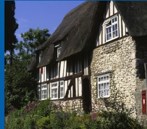
Whether a property has earth bearing against it is a key factor