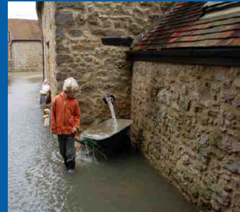
Properties susceptible to flooding require a full waterproofing system