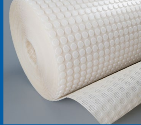
Newton 805 Newlath is the industry leading damp proofing membrane

We are always delighted to advise on any waterproofing or damp proofing projects, please call 01732 360 095 to speak with our technical team who will be only to pleased to assist.