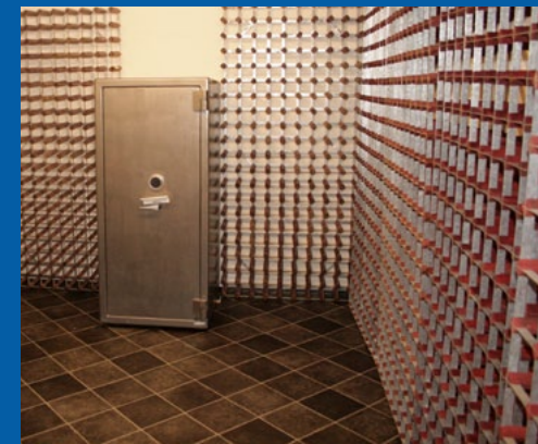
In basements, a full waterproofing system like Newton System 500 is essential