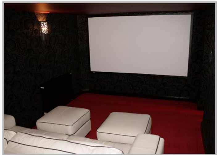
The dry basement has now been converted into a home cinema