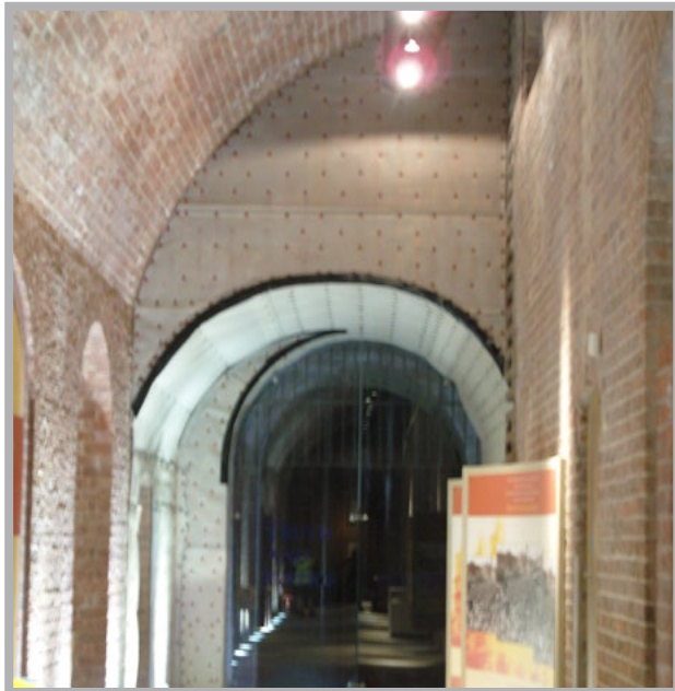
Newton 803 Newtonite skilfully applied to fit the contours of the walls

Newton System 800 damp proofing membranes were the ideal solution as they are deemed 'reversible' making them acceptable for conservation requirements, and they could be applied to follow the contours of the structure, as shown in the images below.