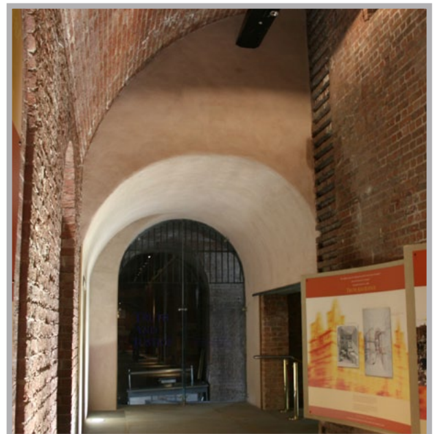
Plaster has been applied directly to the meshed membrane to form a new wall surface