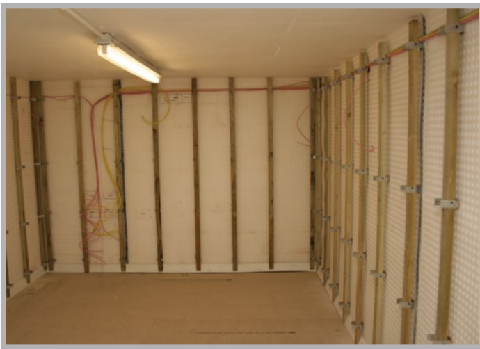
Application of Newton 508 cavity drain membrane to all retaining walls