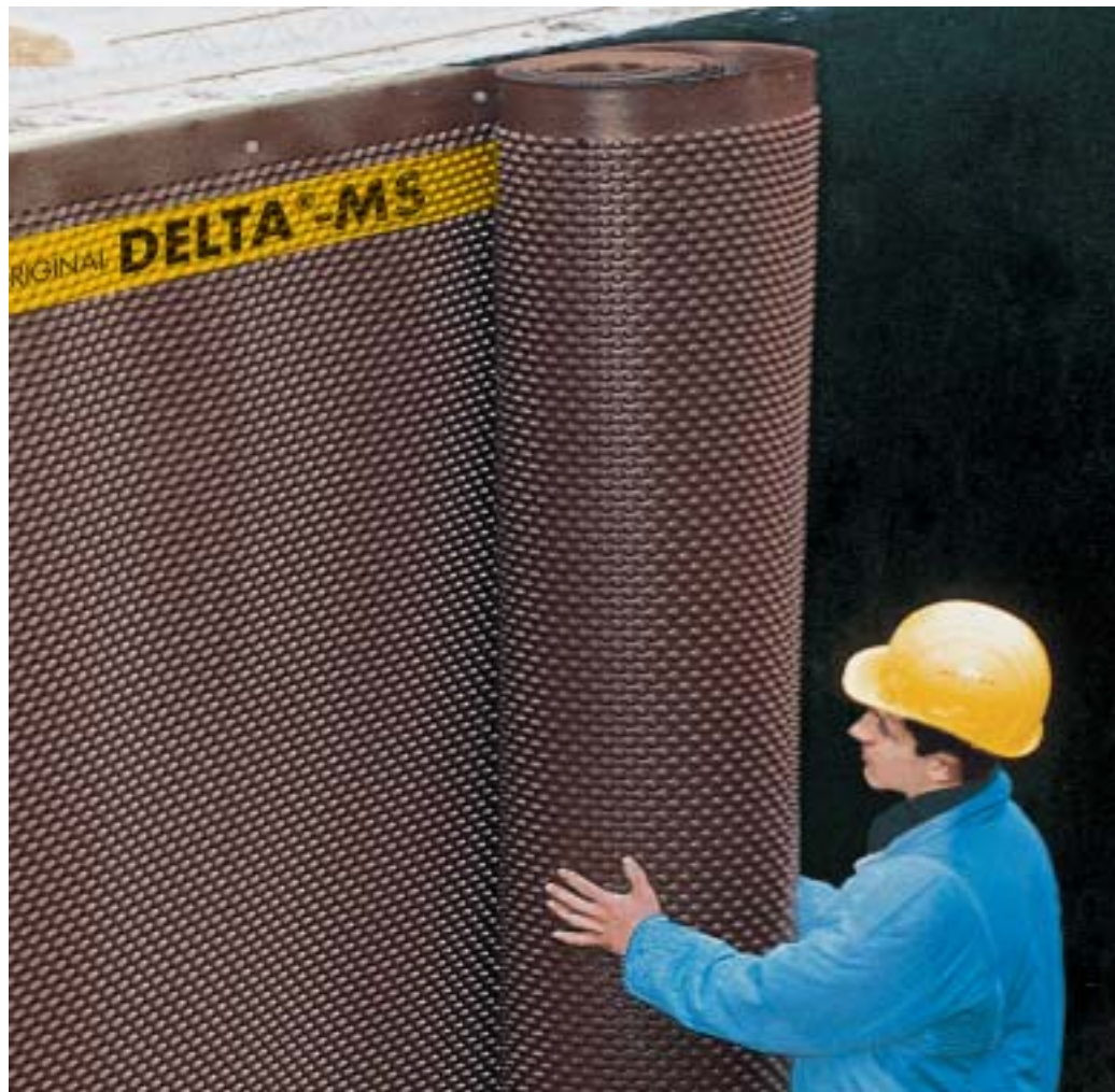
Easy to install, DELTA®-MS safely protects foundation walls.