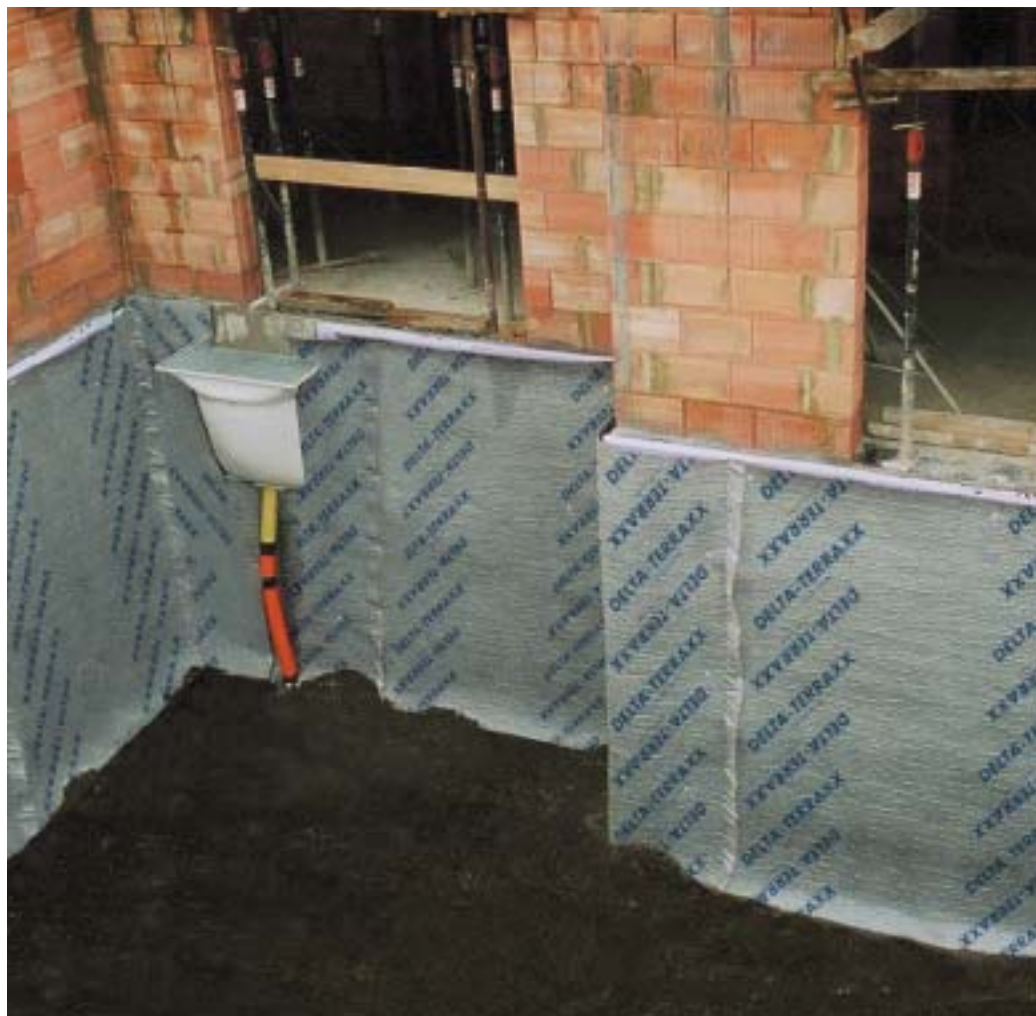
DELTA®-TERRAXX offers permanent-filtration draining.