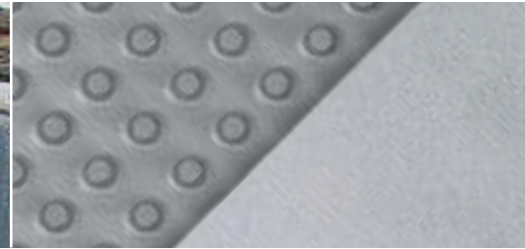
NOPPENBAHNEN-PROFIL with DELTA®-GEO-DRAIN CLIP.