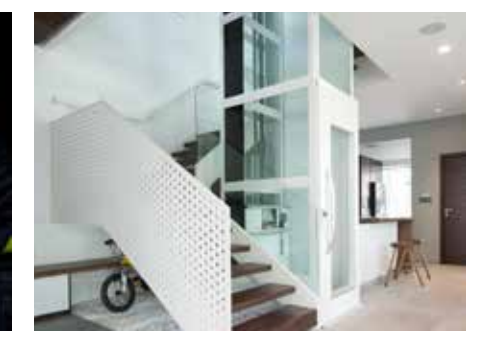
Day 3 – Installation Third day – The finishing touches are applied and all functions of the lift are tested. Your lift is now ready to use.