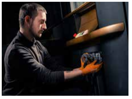
Day 1 – Installation First day – The bottom frame, guides and platform are installed. Your platform lift can be installed with or without a lift pit.