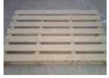
Topblock Standard Pallet