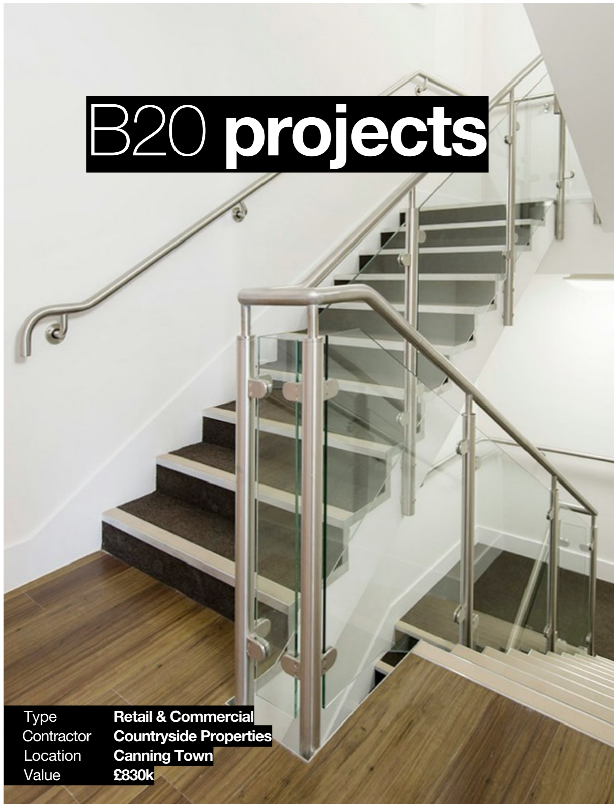
Type Retail & Commercial Contractor Countryside Properties Location Canning Town Value £830k