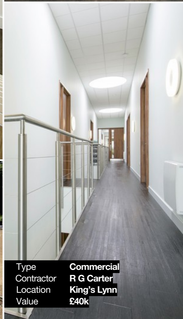
Type Commercial Contractor R G Carter Location King's Lynn Value £40k