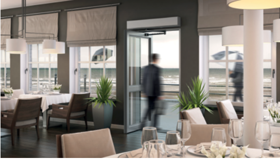
ASSA ABLOY SW100 B

The balance swing door system is designed to work in narrow passages and corridors and is strengthened to withstand the pressure of intense traffic, windy conditions, cross-drafts and air pressure. Available in two versions: ASSA ABLOY SW100 B and ASSA ABLOY SW200 B.