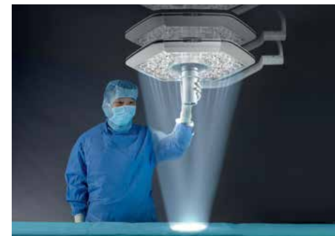
Consistent illumination at typical working distances.

When the light head is repositioned, the 3D sensor automatically adjusts to ensure a consistent illumination level. This eliminates any manual readjustments to the lighting conditions — saving time and allowing the surgeon to focus on the surgical site.