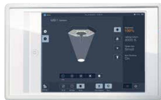
Intuitive and reliable wall control.

The slim design of the iLED® 7 Surgical Light, developed from specific requirements of OR personnel, is ideal for conventional or laminar air flow systems. Key design elements include the opening in the center of the light, the rounded edges and smooth surfaces, making it easy to clean. Additionally, the compact design and lightweight materials support and simplify positioning.