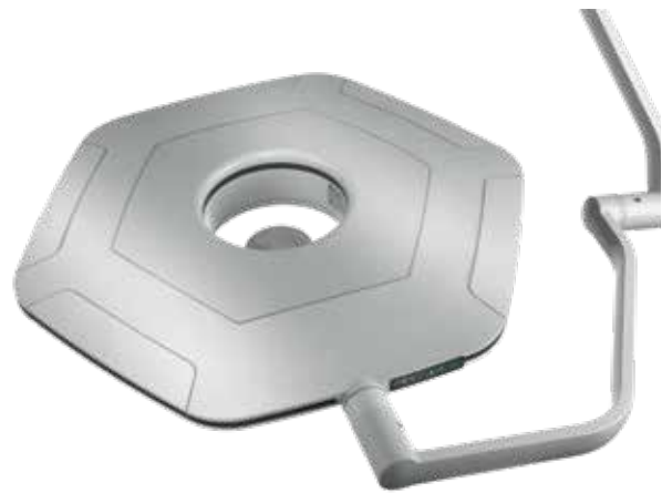
Streamlined design for enhanced air flow.