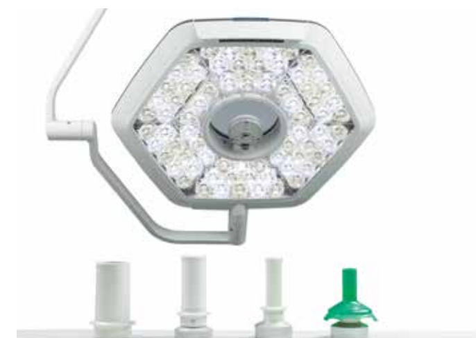
All iLED® 7 Surgical Light's are camera ready — enabling you to upgrade at any time.

The flexible interface allows the light head to be fitted with standard, disposable, camera and sterile light control handles. Therefore, all light heads are camera ready — enabling you to upgrade your light head at any time.