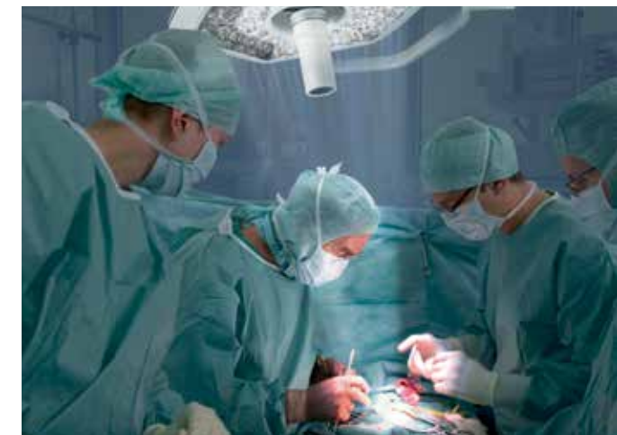
3D sensor technology provides consistent lighting of the surgical site.

The iLED® 7 Surgical Light's 3D sensor system provides consistent lighting conditions and eliminates unwanted shadows, even when the surgeon is working directly beneath the light head. The system identifies obstacles in the field of illumination and activates or deactivates individual LED modules accordingly. As a result, the surgical field is properly illuminated without the need for manual adjustment allowing the surgeon to focus on the patient and the task at hand.