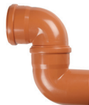
920 Foul air-trap PVC-U Ø110mm