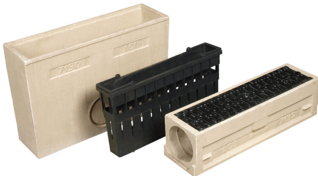
Sump unit composite grating, with silt bucket Load Class C 250